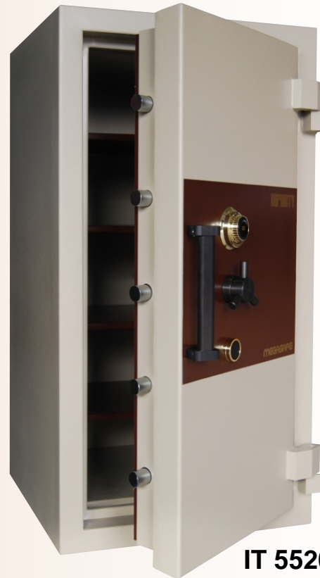
IT 5520 Gold Edition