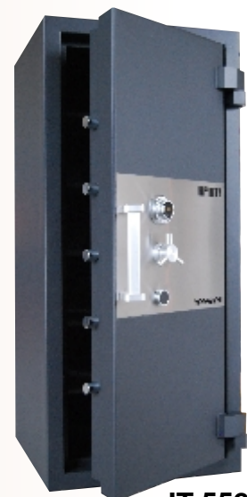
IT 5520 Graphite Gray & Stainless